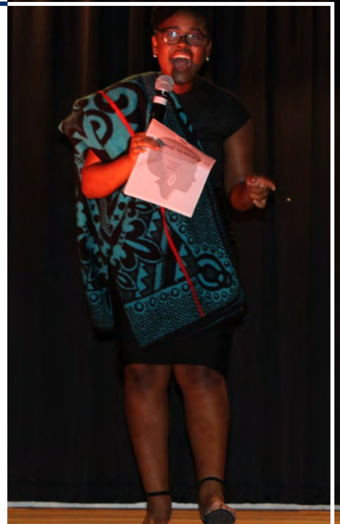
"Here's to one of the best events at Rhenish!

The Siyaphambili Cultural Evenings are always jam-packed with fun experiences and wonderful performances and this year certainly lived up to the hype.